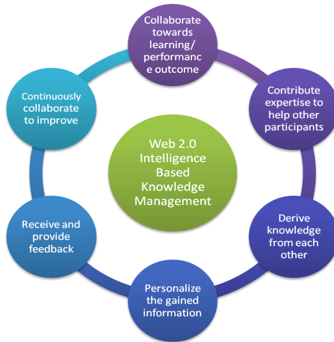
Figure 2. Intelligence Based Knowledge Management

The technological capabilities of the Web 2.0 platform support the computational aspects of knowledge management, and the social collaborative aspect provide an opportunity for the re-use of knowledge in an efficient manner. Web 2.0 ID utilizes the co-identity of the social context, the paradigm of intelligence-based knowledge management, and the distributed environments, to not only center the final outcome about the learner, but the design process as well. Web 2.0 ID is built around a learner design cycle based on continuous collaboration and performance improvement (Stokes & Richey, 2000), which capitalizes on the duality of Web 2.0 as both the social context and distributed environment.