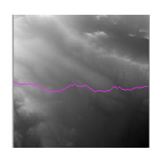
Figure 3: Mountain Path

K-means clustering is a simple unsupervised method to find clusters in a spatial dataset. A number cluster centroids are distributed randomly initially. Each point in the database is allocated to the region represented by the closest centroid. Then the centroid is updated to be at the barycenter of the points in the region it represents. While k-means clustering is