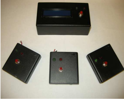
Figure 1. The Game Master and End Point devices.

The hardware used for this system consists of an Access Point microcontroller available with the Game master interfaced with a LCD module, and multiple End Point modules available with the participant modules.