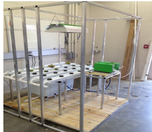
Figure 3: (a) Nursery of the plants