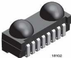
FIGURE 3 TFDU4100: INFRARED TRANSCIVER

The transceiver module consists of a PIN photodiode, an infrared emitter, and a low-power analog control IC to provide a total front-end solution in a single package.