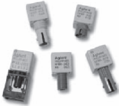
FIGURE 2 HFBR-0400 SERIES: OPTICAL FIBER TRANSCIVER